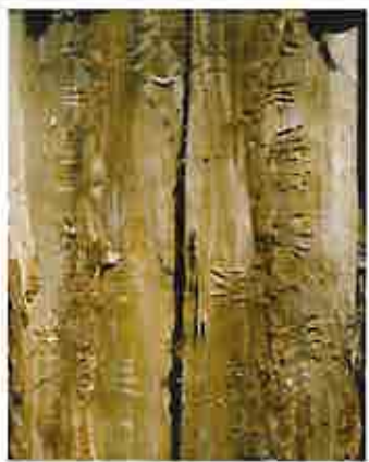
MOUNTAIN PINE BEETLE GALLERIES

Mountain pine beetle attacks most native and introduced pine species, except Jeffrey pine which is attacked by the very similar Jeffrey pine beetle. Occasionally spruce are attacked, especially when mixed in a stand of host pines. Periodic mountain pine beetle outbreaks kill millions of pine trees throughout forests of western North America, making it one of the West's most important bark beetles.