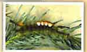
OLDER DFTM LARVA WITH "TUSOCKS" AND "HORNS"

Although feeding larvae prefer new needles, older needles are often consumed during outbreaks. Trees often appear reddish-orange in color as partially consumed needles fade. Branch tips will be bare and often covered with silk webbing and dead needles.