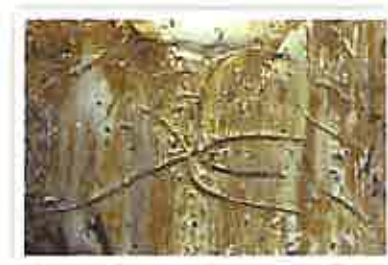
WESTERN BALSAM BARK BEETLE AND GALLERIES

sect are often initiated by prolonged drought and windthrow.