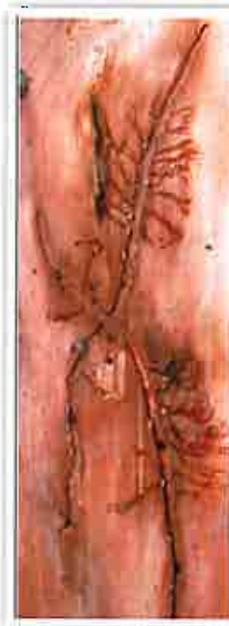
H-SHAPED GALLERY TYPICAL OF IPS

Ponderosa pine is also a preferred host for several other ips beetles. The Arizona fivespined ips, found in southern Utah and the southeast portion of Nevada, can be fairly aggressive, attacking large trees over a wide area when drought conditions develop. The emarginated ips and six-spined ips, both larger engravers about 1/4-inch long, have caused tree mortality during drought years in