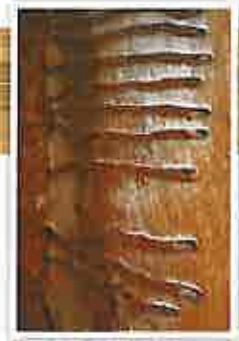
FEEDING LARVAE GIRDLING TREE

B ark beetles are small ( \leq 1/4 -inch long), hard bodied beetles that bore through the tree's protective outer bark to lay their eggs in the living tissue underneath. Following adult egg-laying, the developing larvae feed on this living tissue, further disrupting nutrient and water flow within the tree. Egg-laying and feeding galleries created by adult beetles and their larvae are unique for each species of beetle. Note that all bark beetle species described in this brochure are native insects.