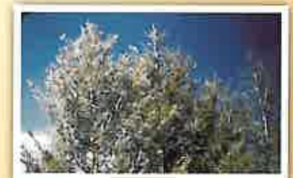
TREE CROWN DAMAGE FROM FEEDING LARVAE

Although feeding larvae prefer new needles, older needles are often consumed during outbreaks. Trees often appear reddish-orange in color as partially consumed needles fade. Branch tips will be bare and often covered with silk webbing and dead needles.