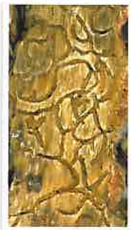
WESTERN PINE BEETLE SERPENTINE EGG GALLERIES

Although in the same group as the previous beetles, this native bark beetle tends to be less aggressive, generally attacking individual large, overmature ponderosa pines. Often these trees have been hit by lightning, have root disease, suffer from drought, or are otherwise stressed. However, they can cause patches of mortality in dense stands of medium-sized trees. During periods of