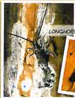
LONGHORN WOOD BORER

Even woodpeckers ( SAPSUCKERS ) can make holes in the bark that may look like bark beetle entrance/exit holes.