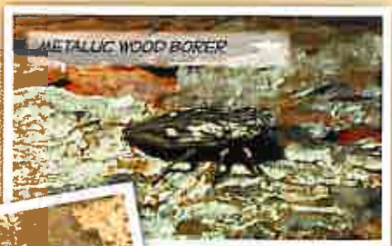
METALIC WOOD BORER