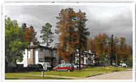
FADING TREES ATTACKED BY BARK BEETLES

Many species of bark beetles are causing widespread tree mortality throughout the Intermountain West. Although sometimes viewed by humans as catastrophic, outbreaks of native forest insects are natural events. Native insects and the plants they use for food and reproduction have evolved together. Unlike some introduced pests, native insects kill individual trees but do not threaten the existence of an entire plant species. Native insect outbreaks only pose a problem when they conflict with human resource values for a particular area (i.e., recreation, aesthetics, wildlife habitat, wood production, property values, etc). A tree in the wilderness is not subject to the same human values as a tree in your backyard.