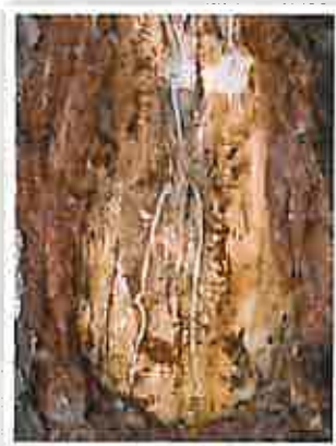
TYPICAL IPS GALLERY

Pinyon ips are about 1/8-inch long, with an indented backside (versus a rounded back end) and small spines that are typical of all Ips species. Gallery patterns of most ips are similar, often a Y- or H-shape, with a larger mating chamber from which the separate egg galleries radiate. Larva and beetles overwinter under the bark where they consume large patches of inner bark. Wood borers often infest trees after pinyon ips attacks.