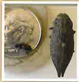
A BARK BEETLE (LEFT) AND METALIC WOOD BORER (RIGHT)

Wood borers are much larger than bark beetles. These borers feed on the phloem just as bark beetles do; however, their galleries lack a distinct shape. While developing, the larva may drill large oval or round holes into the wood. Depending on the species, their life cycle may take from one to over ten years to complete.