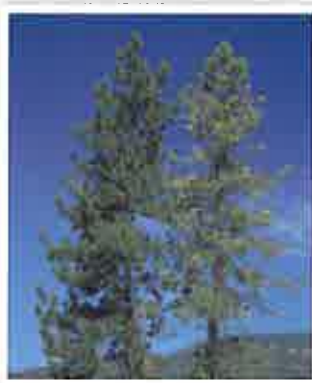
CROWN DIFFERENCES BETWEEN A HEALTHY (LEFT) AND STRESSED (RIGHT) TREE

Not all stressed trees are attacked by beetles, particularly when bark beetle populations are low. However, during bark beetle outbreaks, even healthy trees can be successfully attacked.