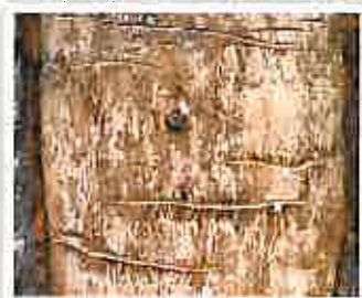
FIR ENGRAVER GALLERIES

fade is often hard to detect; entrance holes are without pitch tubes and in the In-