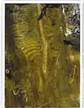
SPRUCE BEETLE GALLERIES

This bark beetle prefers Engelmann spruce, but will attack blue spruce when populations reach outbreak levels. Even during outbreaks, most blue spruce will survive. Outbreaks typically begin in areas of wind-thrown trees, with adult beetles dispersing to adjacent standing trees.