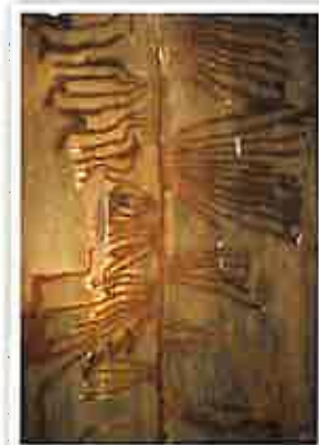
DOUGLAS-FIR BEETLE GALLERIES

Although the beetle prefers larger host trees, it will attack and kill trees of many sizes. Trees < 8 inches in diameter, however, are more commonly attacked by Douglas-fir pole beetle. Dense stands of susceptible hosts spread over large landscapes can result in widespread mortality.