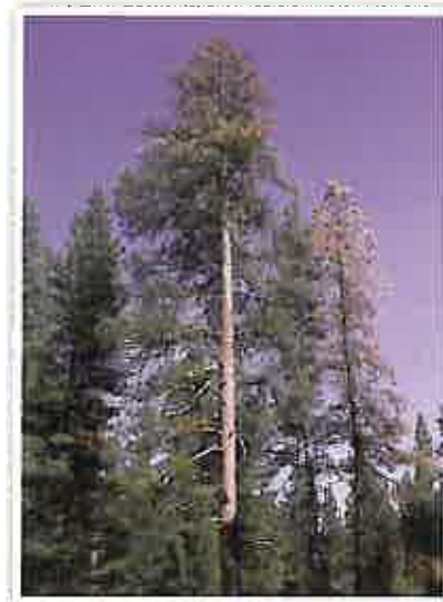
TOP-KILL OF A LARGE PONDEROSA PINE BY PINE ENGRAVER

logs or trees. Once spring temperatures reach 65°F, beetles begin to fly until cold fall weather stops dispersal.